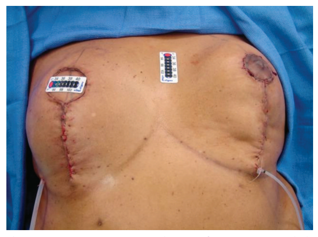
Fig. 1. Temperature strip technique for monitoring darkskinned patients.

It seems that detection of flap perfusion problems occurred later in dark-skinned patients. In