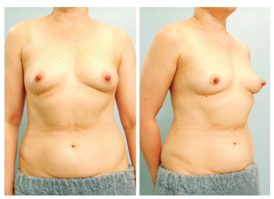
Fig. 2. Preoperative anteroposterior (left) and oblique (right) views.

group. However, this was not statistically significant because of the small sample size (Table 1).